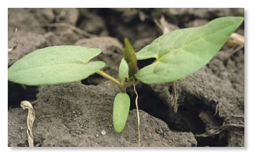
Figure 3. Note the narrow cotyledons and rounded base on this wild buckwheat seedling. The weed's leaves are alternate, heart- or arrowhead-shaped, and pointed at the tips.